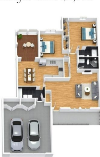
Mt. Kit Carson 2 bed, 2 bath $3,800