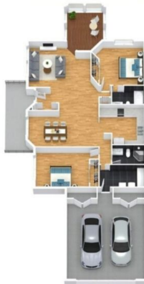
Mica Peak 2 bed, 2 bath $3,900