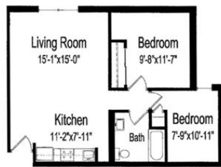
2 bed, 1 bath $2,100