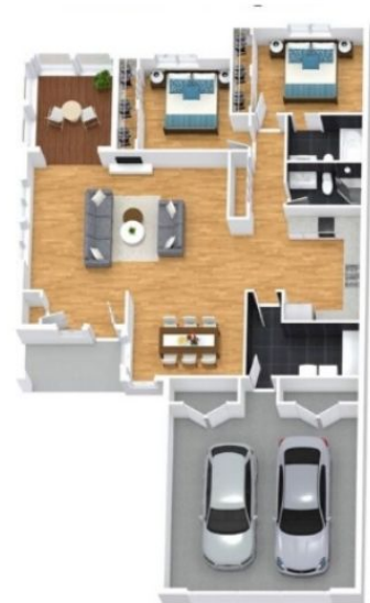
Mt. Spokane 2 bed, 2 bath $4,300