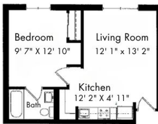
1 bed, 1 bath $1,670